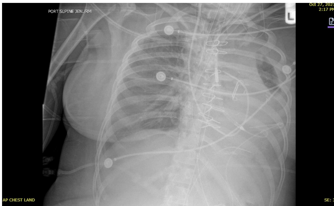
Figure 2 Admission chest x-ray. Chest x-ray demonstrating mediastinal widening, enlarged cardiac silhouette, and blunting of the left costophrenic angle prior to evacuation of hemo-pericardium and hemothorax.