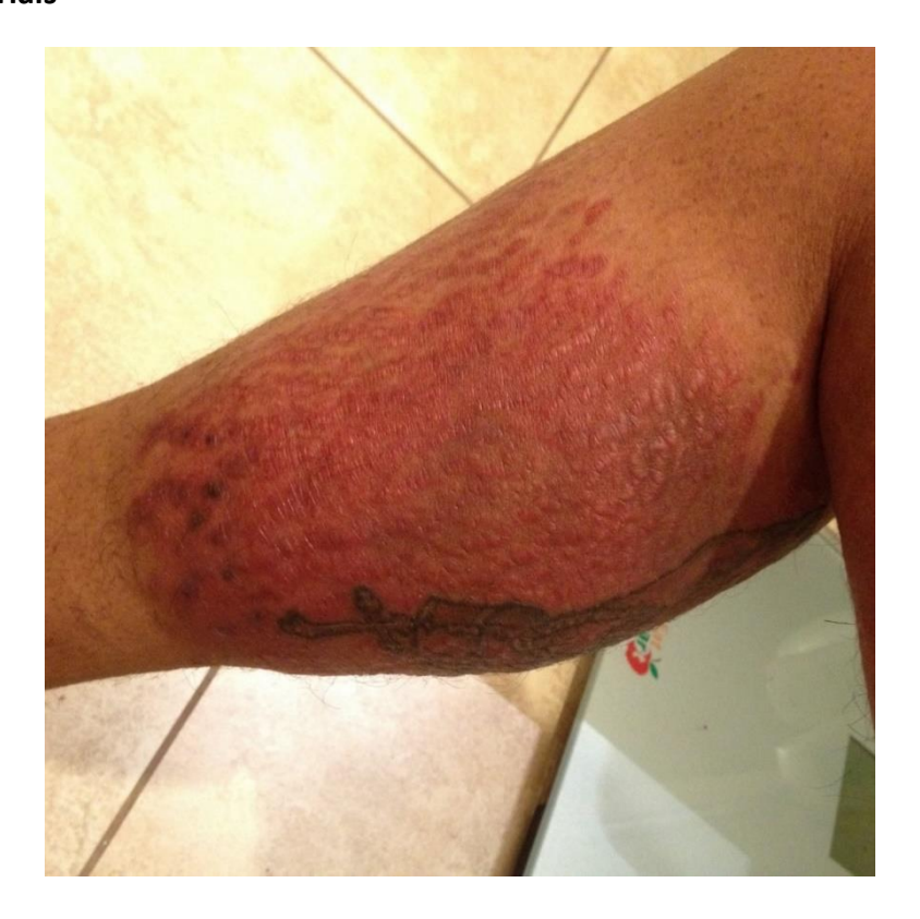
Figure 1 Patient photo of dermal cryptococcus in January 2015.