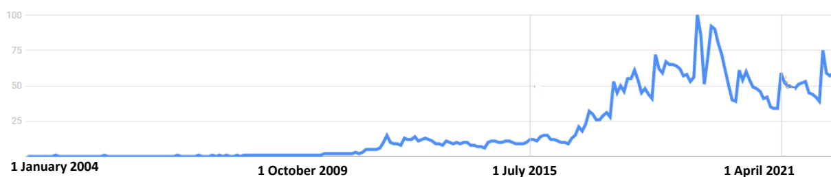
Figure 2 Interest over time as measured by Google Trends about 'intermittent fasting' worldwide.

Although we have explained several types of intermittent fasting, as are Mosley's, Every-Other-Day, Warrior, and Nagumo's diets, we want to finalize this narrative review looking for other types of this treatment due to that many internet users are looking at this diet, as reflected in Google Trends (Figure 2).